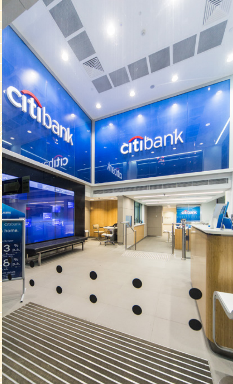
CITIBANK QUEEN STREET MALL BRANCH 141 Queen Street, Brisbane $1.2 million/265 m 2